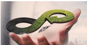
Information & communication technologies (ict)

Any SME providing solutions from the following sectors: